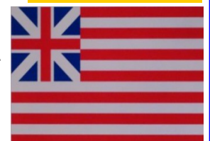
Union Flag compliment to United Colonies