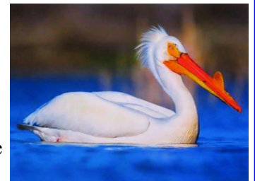
Must be mating season