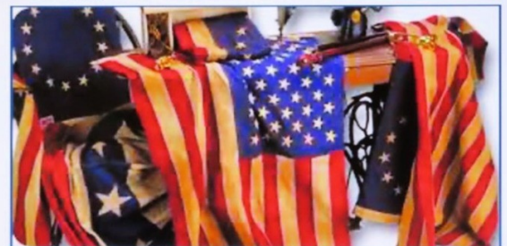
Still flying "O'er the land of the free and the home of the brave"