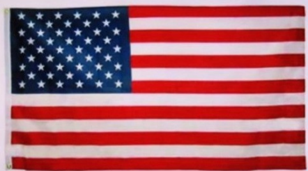
Fifty Stars and Thirteen Stripes