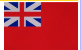
Meteor Flag or The Jack

Across the pond, in America the British colonists had been flying the British Flag for 150 years. The came the 7 years war, aka French and Indian War: 1756-1763.