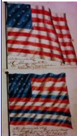
Dutch paintings of different American Flags

June 14, 1777 is now the day we celebrate as Flag Day. The war waged on. The old Union Flag with the British Union in the upper left corner became obsolete. When Congress convened in Philadelphia 7/14/76, this insignificant item among other more pressing issue was entered into the official journal. "Resolved that the flag of the