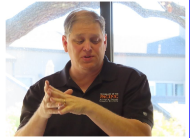
Need 100 more Readers

white pelican is one of the largest birds in North America. It has a wingspan of up to 9.5 feet and a huge, pouched bill. Their large heads and huge, heavy bills give them a prehistoric look.