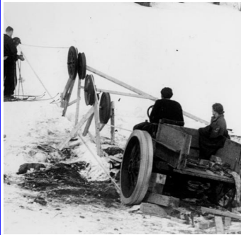
Ancient Rope Tow

One of the largest North American birds, the American White Pelican is majestic in the air. The birds soar with incredible steadiness on broad, white-and-black wings. The American