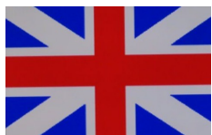
Unified Brit/Scott Flags

In Genoa, Italy, accredited as a city state in 958 A.D. The red cross of patron Saint George, was the flag by 1100. By 1386 King Richard's Crusaders were wearing the cloth version on the front and back of their uniforms.