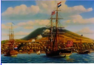
Andrea Doria flies the Union Flag

In 1776 our Navy took to the high seas and was flying the Union Flag. As the war continued, we were beginning to be taken seriously by foreign nation. November 16, 1776 the Andrea Doria was recognized by a Dutch Island in the West Indies: St. Eustatius. This was the first salute given the American flag by a foreign port. It was entry into the Society of Nations of a new Atlantic state destined to change the direction of history.